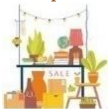
Table Top Sale – 2pm to 4pm Saturday 4th November

Please bring cash so we can give change to people who have only brought notes.